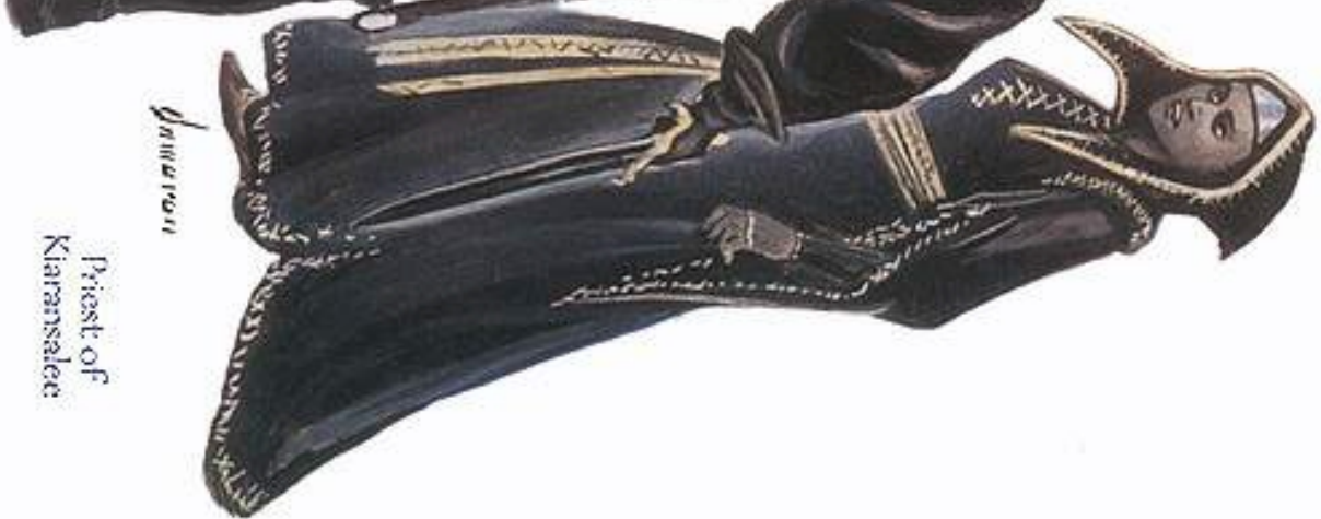
Priest of Kiaransaece