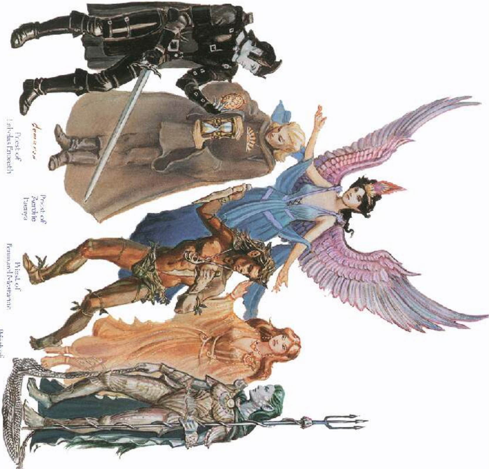
Priest of Egoth Ilsewe