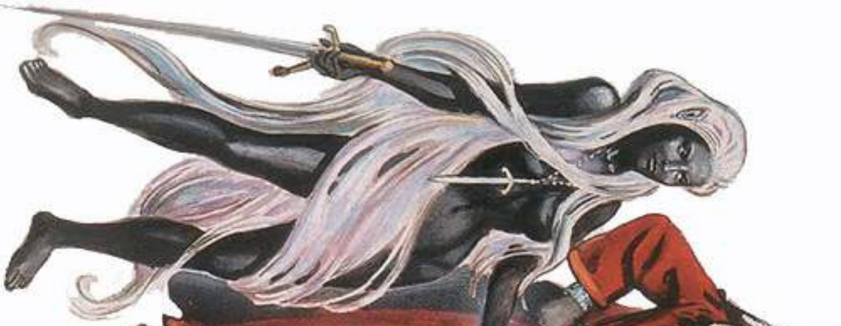
Priest of Elistracee