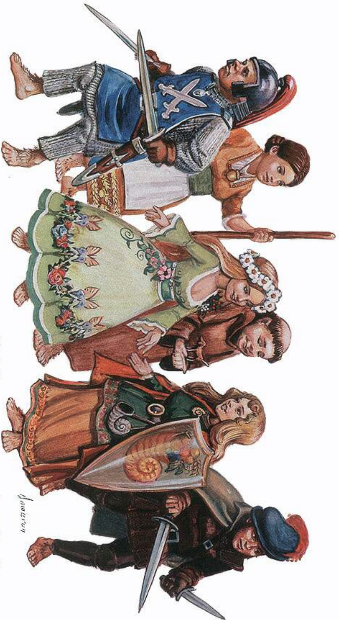
Priest of Arvorean