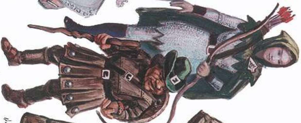
Priest of Solonor Thelandira