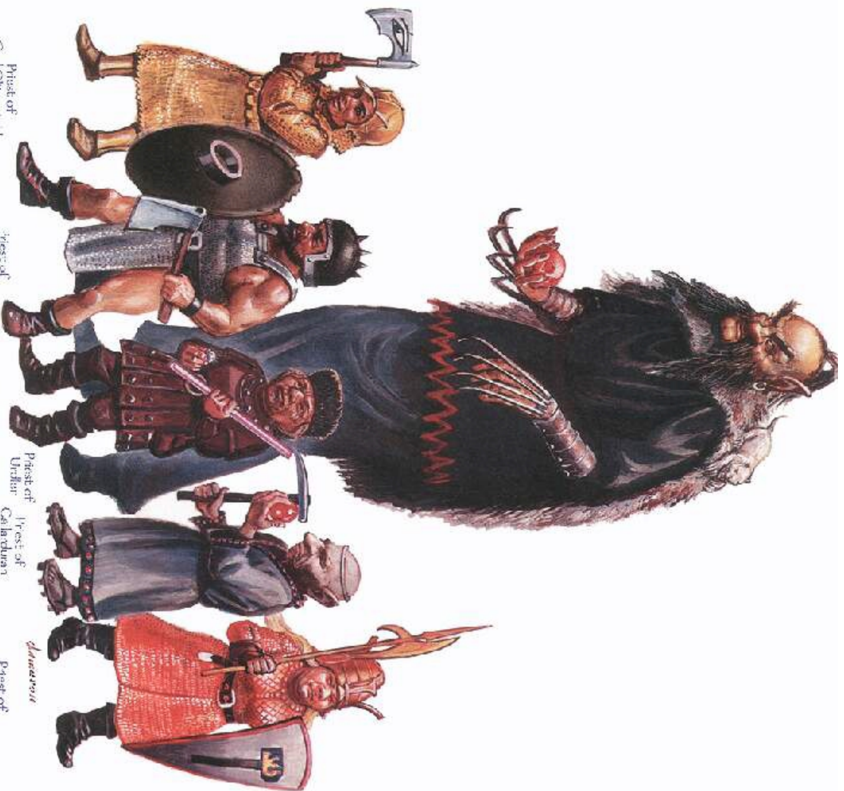
Priest of Carl Giltengod