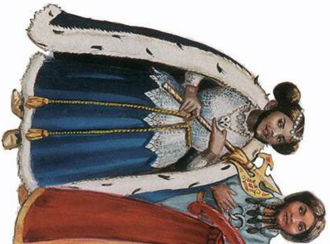
Priest of Deep Duerra