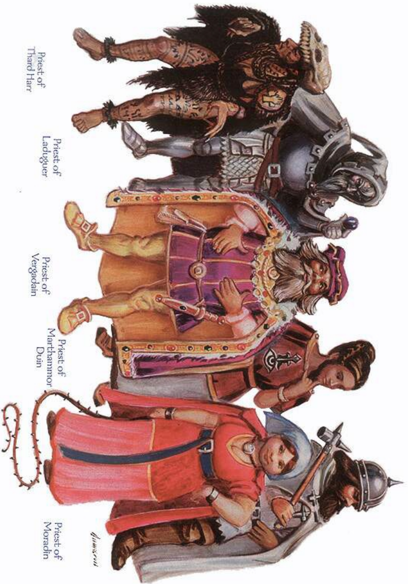
Priest of Thard Harr