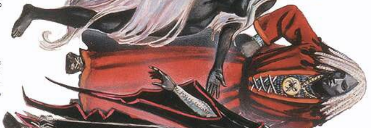
Priest of Selvetarn