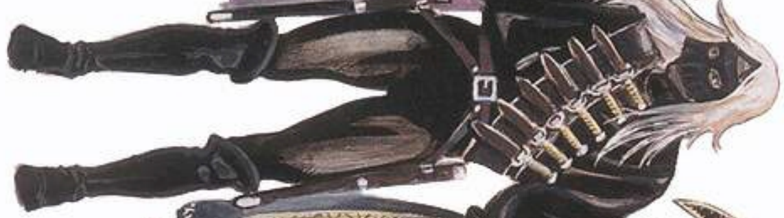
Priest of Vhaeraun