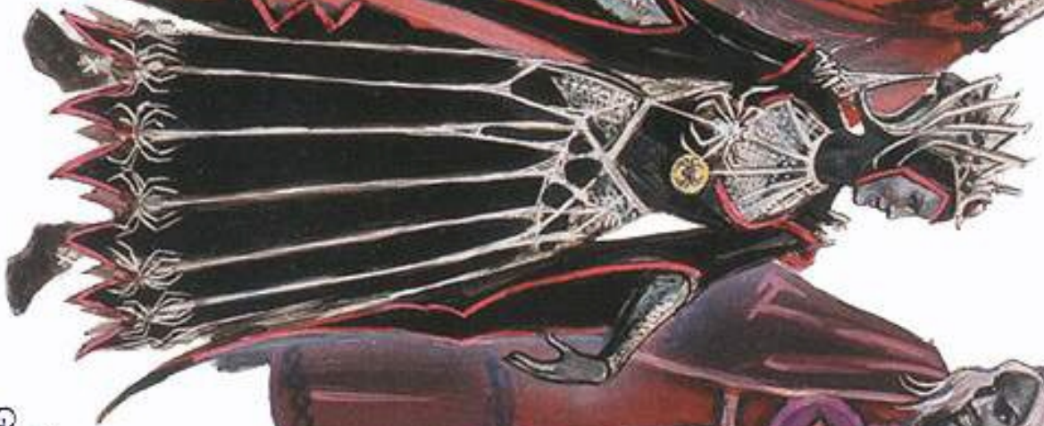
Priest of Lolth