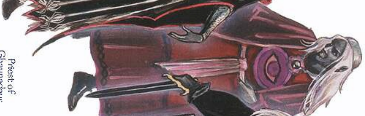
Priest of Ghaunadaur