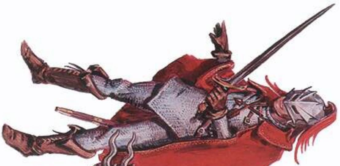
Priest of Shevarash